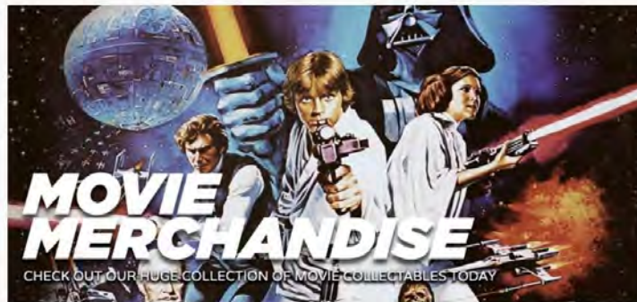
For illustration only. Not related to Star Wars

Ocoin would be providing filmmakers a new way of making and distributing movies. Fans can pay for the tokens which can exchange for merchandises and creating a blockchain platform in which fans can be rewarded for contributing to the community. Either by sharing news about a new movie, distributing merchandises etc. It would be a disruptive platform which can revolutionize movie making.